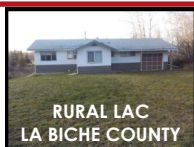
RURAL LAC LA BICHE COUNTY

3.21 acres of private land merely steps lake, boat launch, golf course and minutes to town. Property has 1085 sq ft hillside 2+1 bedroom bungalow with attached single garage, there is also a 24x26 heated detached garage & a 18x20 workshop/storage building. Currently property has a cistern for potable water & tank and field sewage system. For added convenience Municipal water and sewer is available at the property line. This property has so much to offer- raise your family on this 3 acres with lake views or subdivide the property for others to enjoy! The possibilities are ENDLESS!